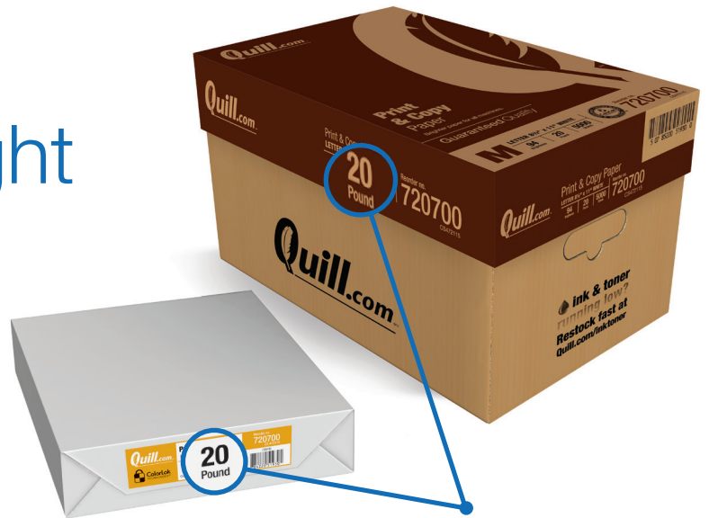
Basis Weight Indicators

Paper manufacturers make paper to a weight standard called basis weight. But what exactly does that mean?